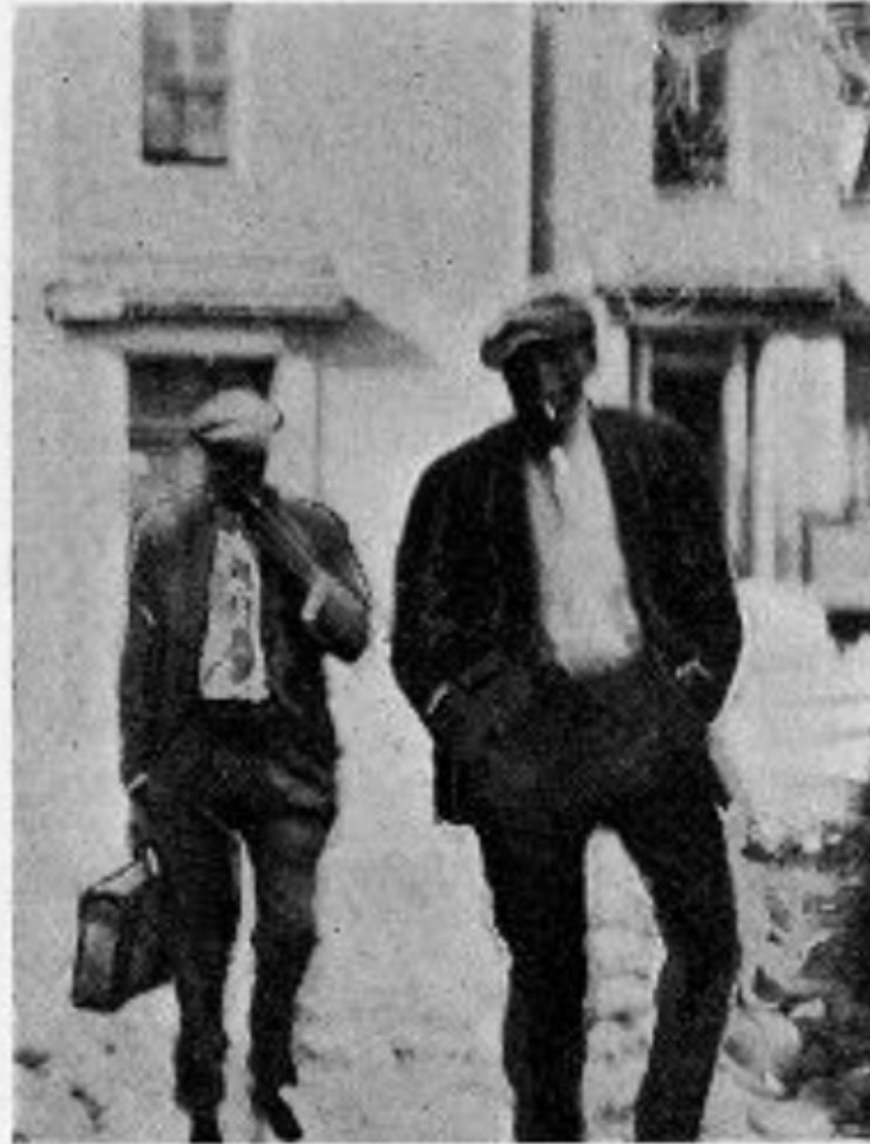
The Migration in Process.