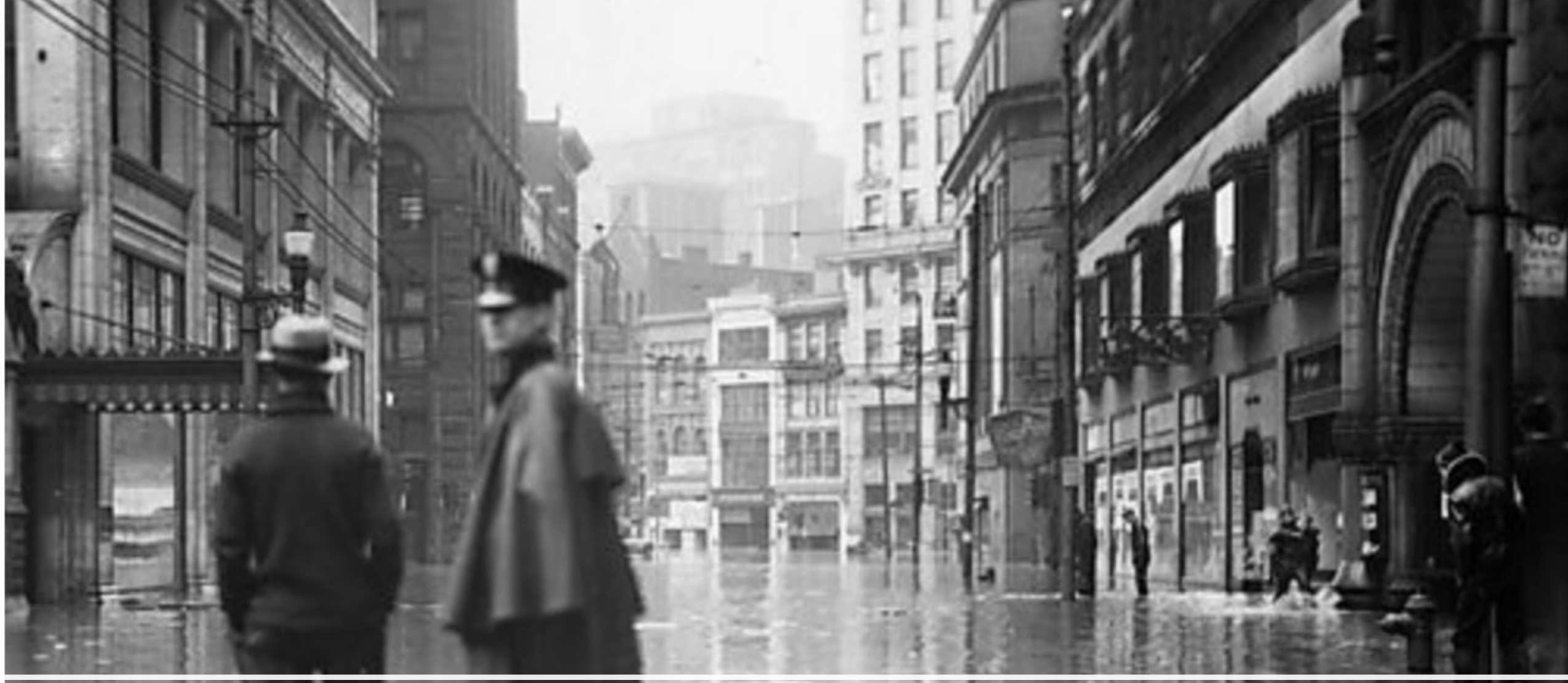
Wood St. after 1936 Flood