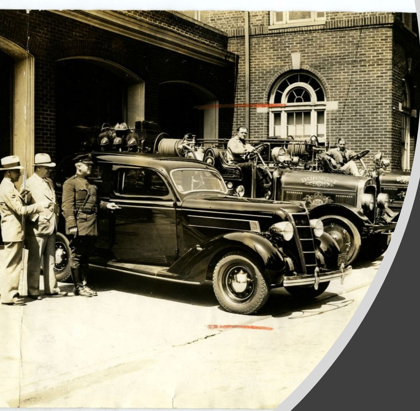
New Dormont Police Car (1935)