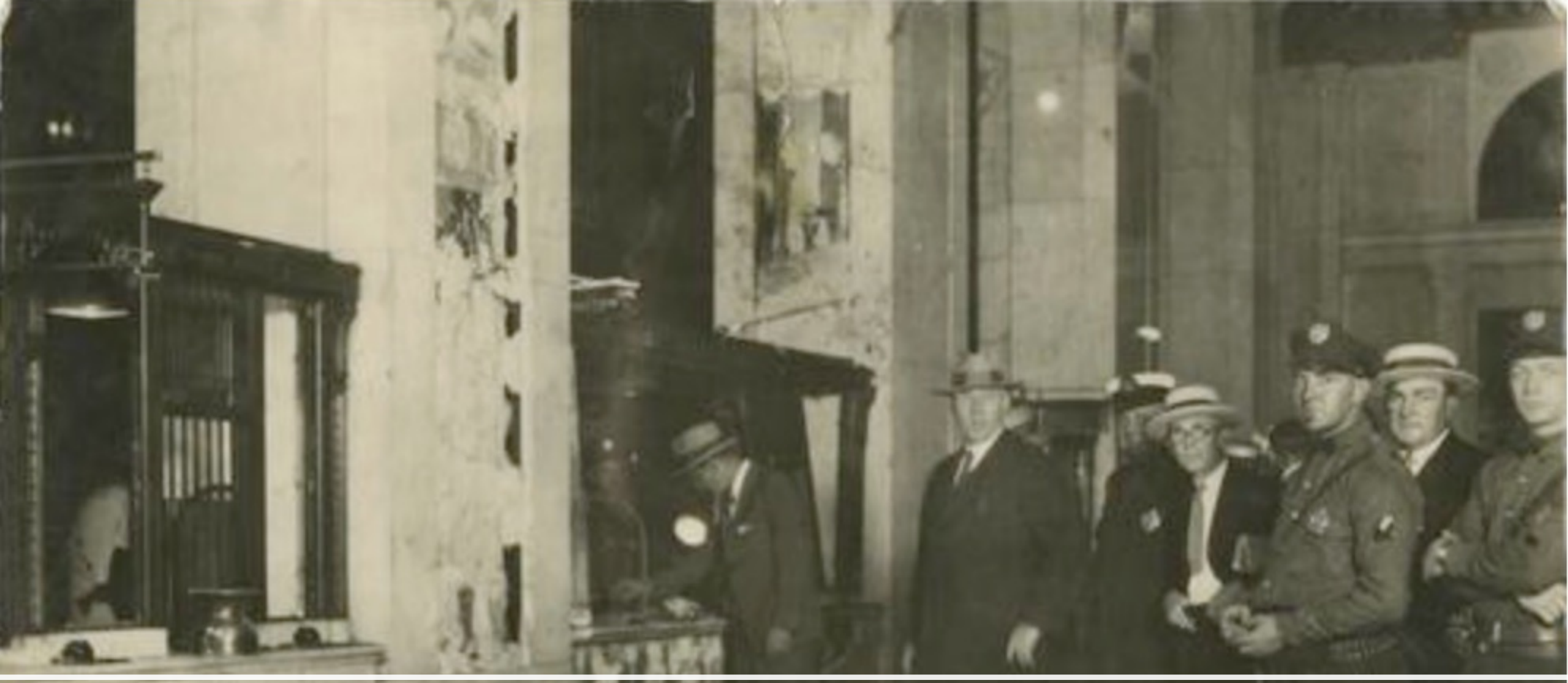
1926 Farmers National Bank Bombing