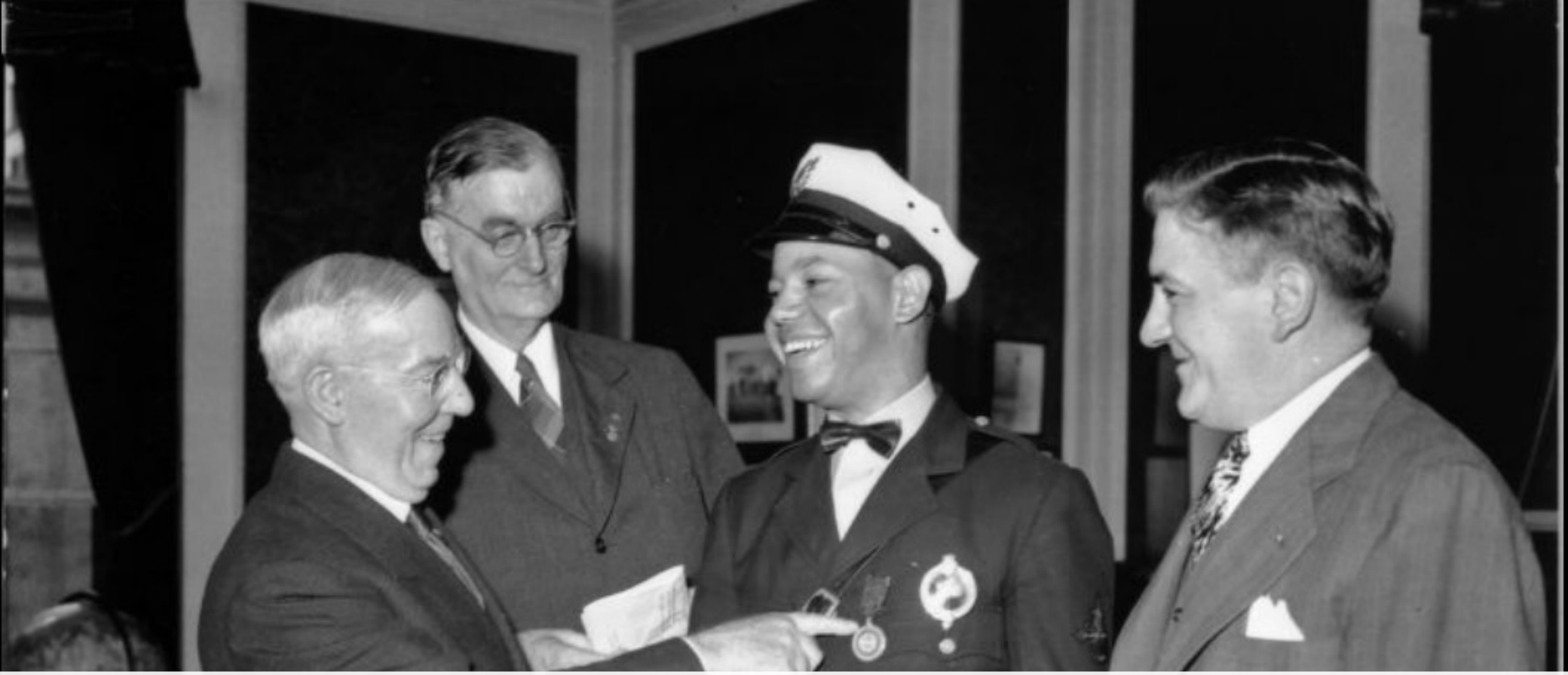
Motorcycle Policeman Receives a Medal from the Mayor (early 1940s)